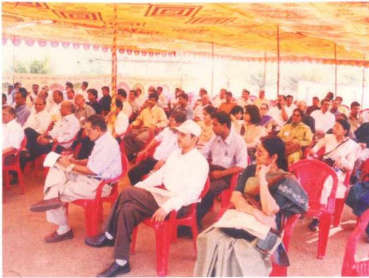
( 150 Participants taken part on event of Consumer Awareness Programme at Birwadi, Shahapur )