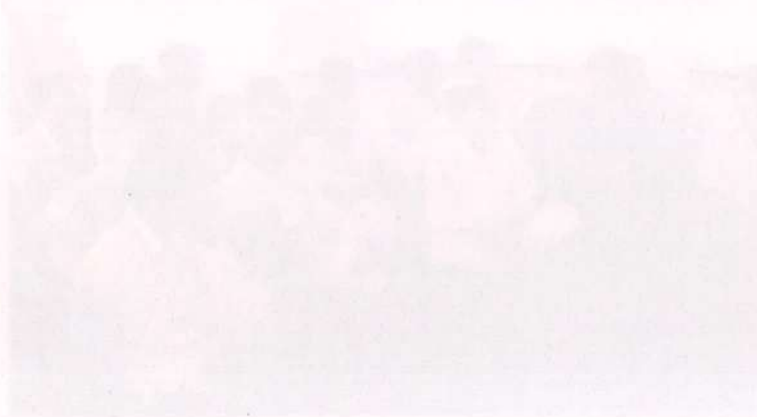
(The Representative of VHA are teaching Agribotry to people at Laha, Shikharpur)