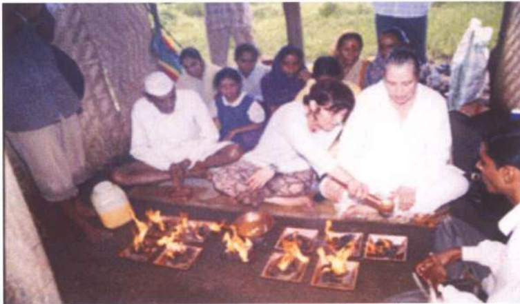
( The Representative of VHA are teaching Agnihotra to people at Lahe, Shahapur )