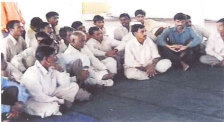
( Various farmers were participated in Informal Training Camp at Training Hall, Village Sajiwali, Shahapur Taluka , District Thane )