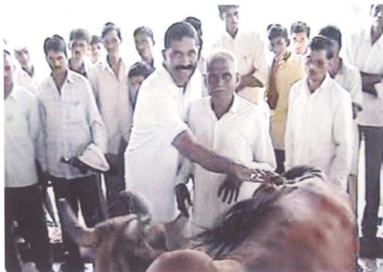
(Goshala is running by VHA, At Village Sajiwali, Shahapur, Dist. Thane)