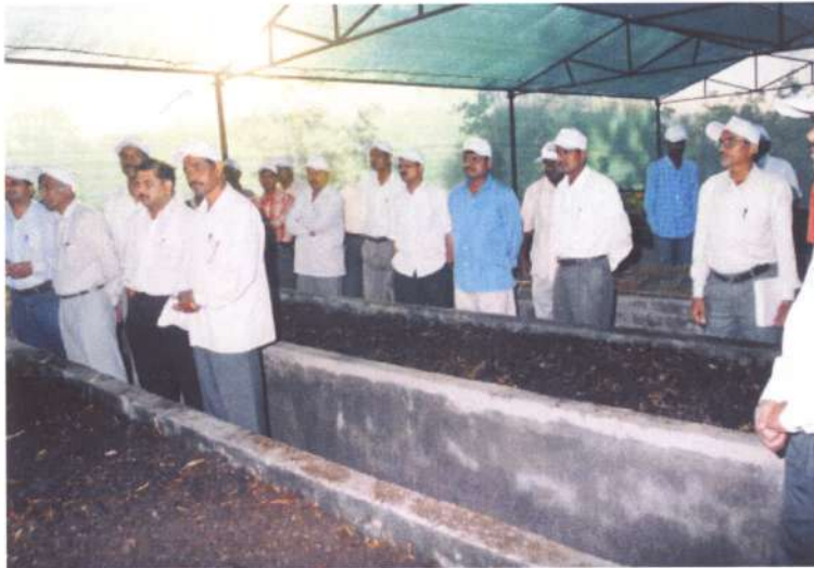
(Office bearers of Agri.Dept. Watching vermicompost bed)