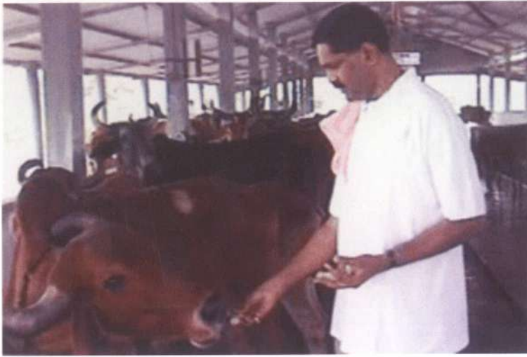
( Goshala is running by VHA, At Village Sajiwali, Shahapur, Dist. Thane)