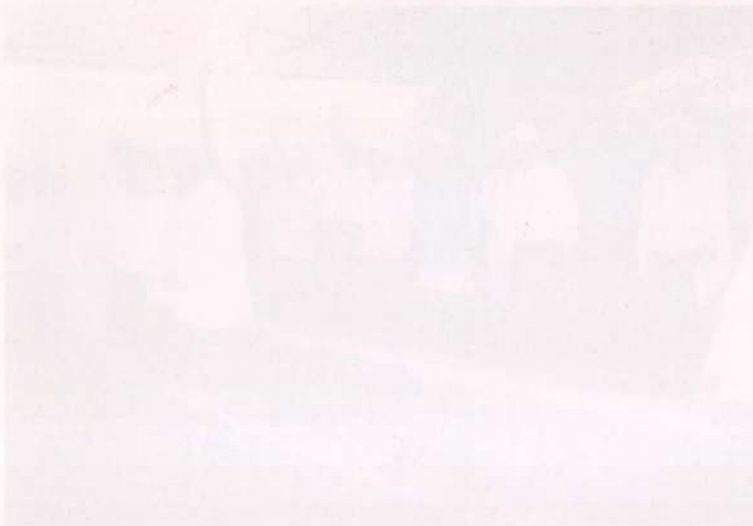
(Office bearers of Agri. Dept. Watching vermicompost bed)