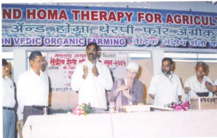
(Training Camp for Informal Training on Organic Farming)