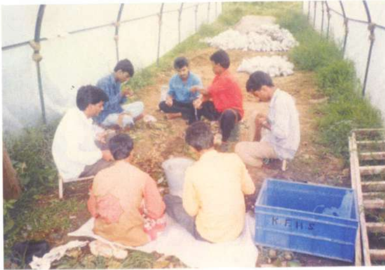
(Participants are taking nursery training at VHA's Nursery Plantation at Sajiwali)