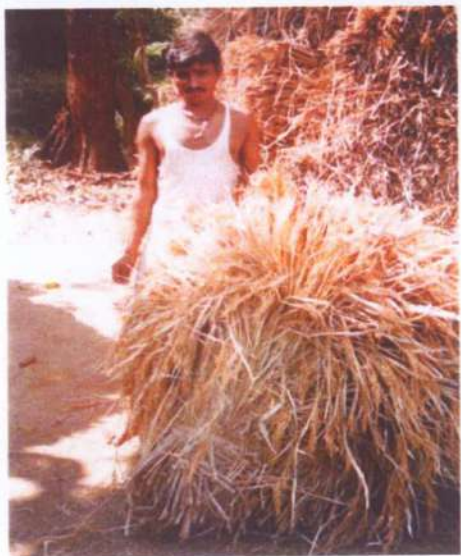
Organic farmer with the paddy harvest