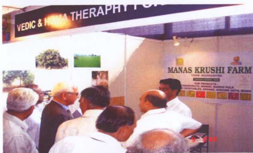
Our Stall at INDIA ORGANIC 2005 at Bangalore.