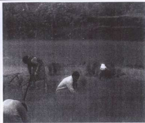
Application of Jivamrut while transplanting