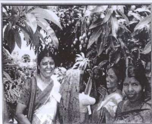
Members seeing the Mango Plantations