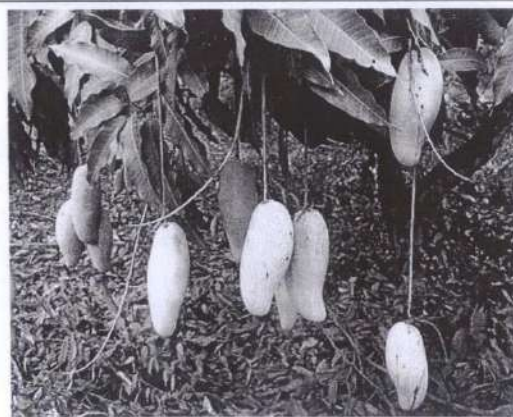
Mulching in Mango Plantation