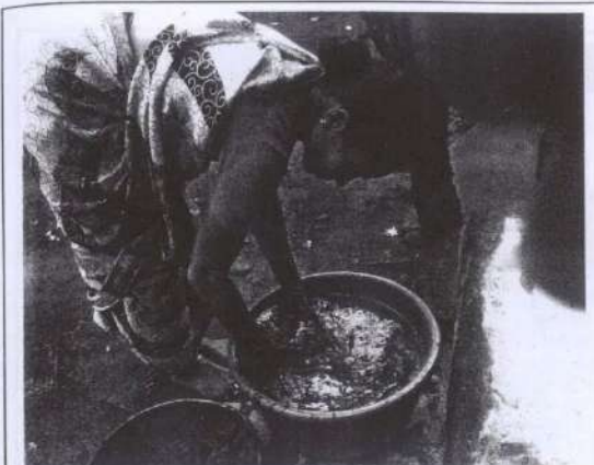
Preparation of Jivamrut