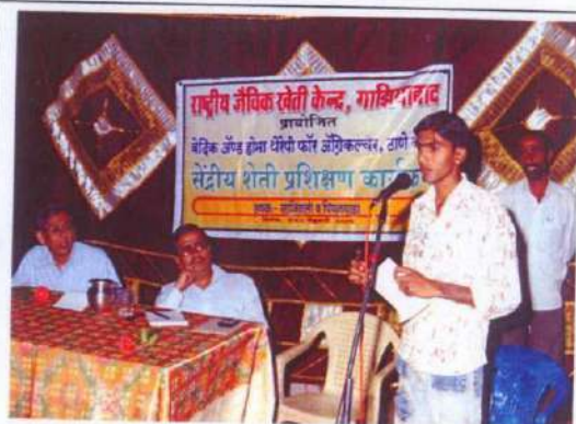
Farmer's feedback on Organic Training Program