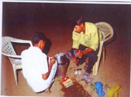
Soil Testing at the farmer's farm