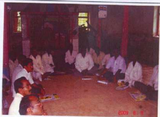
Distribution of Agricultural Calendar to farmers