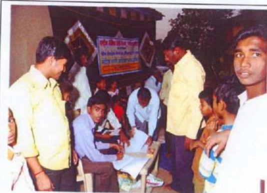
Farmers' registration at village level Training Program