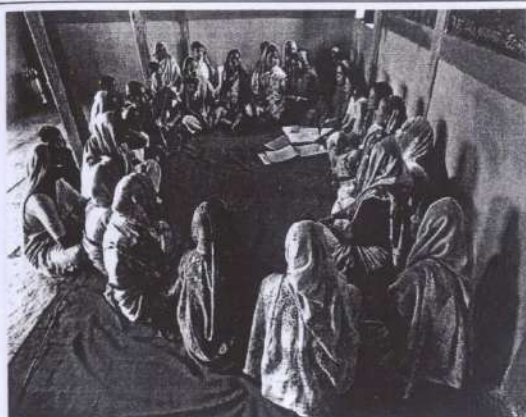
SHG Members' Monthly Meet