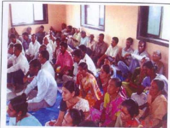
Women's Participations in awareness program