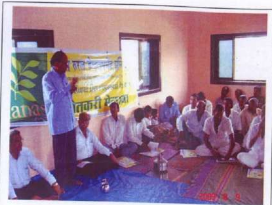
Village level farmers' meet