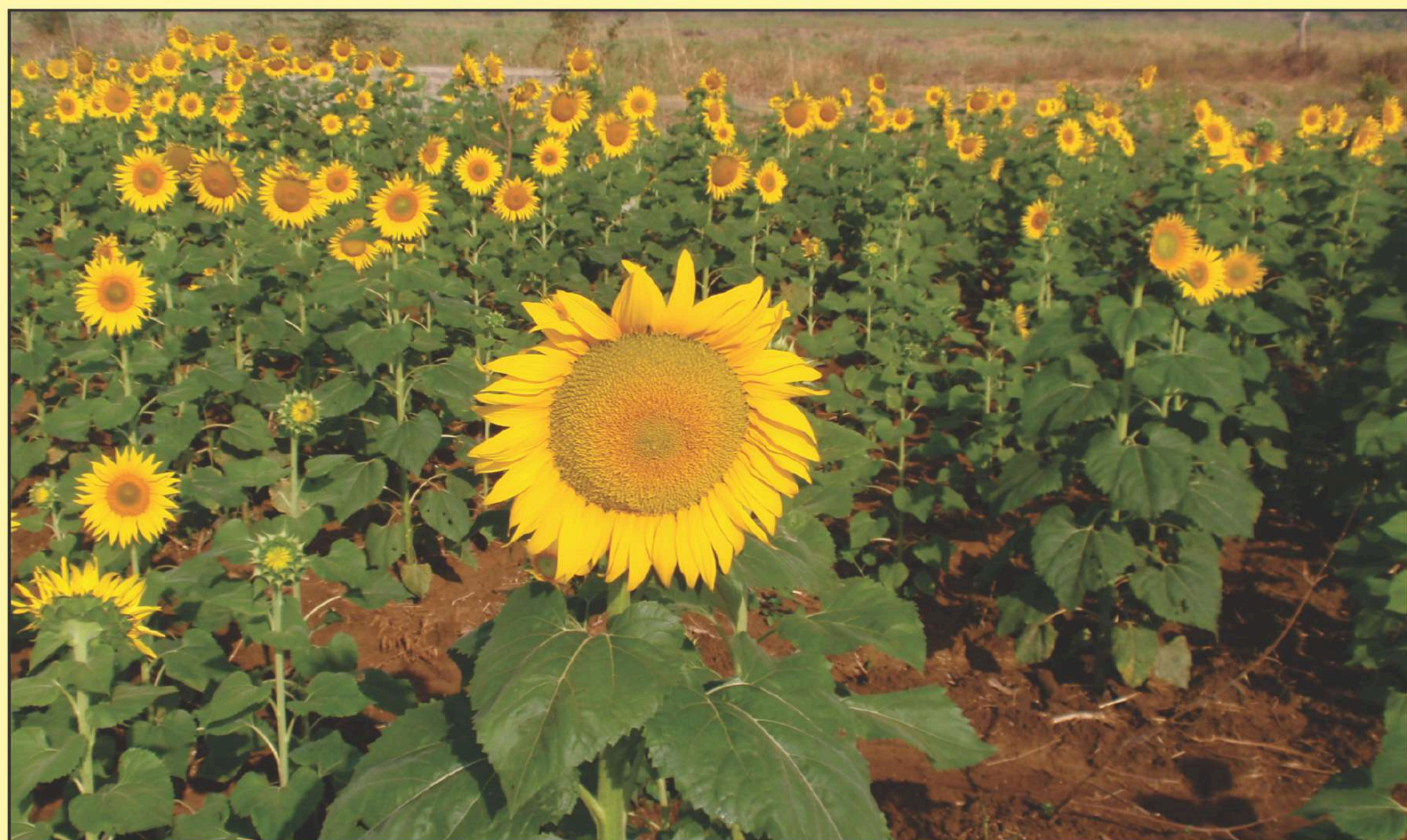
SUNFLOWER CULTIVATION IN ORGANIC FARMING